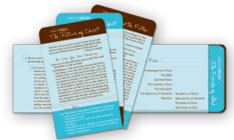
Essential Truths: A Pocket Guide for Growing Deep by Insight for Living card set

For related resources, please call: USA 1-800-772-8888 AUSTRALIA 1300 467 444 CANADA 1-800-663-7639 UK 0800 787 9364 or visit www.insight.org or www.insightworld.org