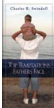
Top Temptations Fathers Face by Charles R. Swindoll booklet