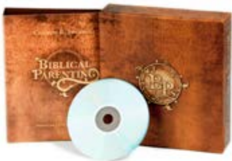
Biblical Parenting by Charles R. Swindoll CD series