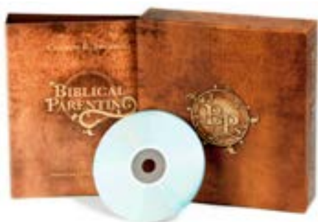
Biblical Parenting by Charles R. Swindoll CD series